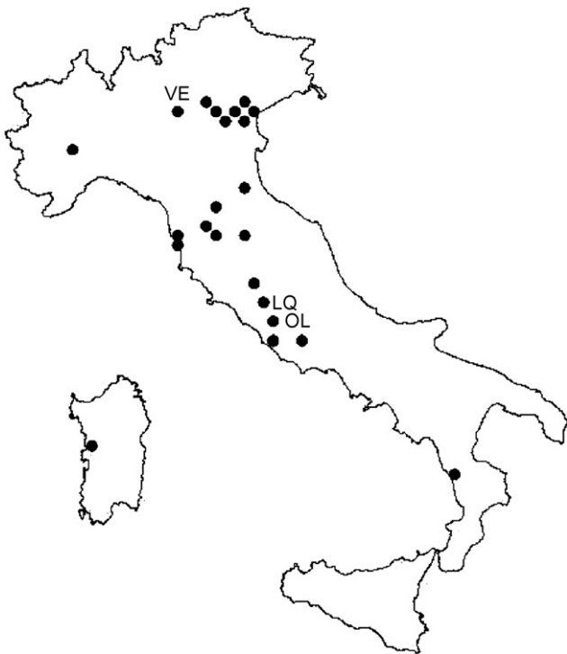
Fig. 1. Geographical location of the 23 study golf courses. OL: Olgiate golf course; LQ: Le Querce golf course; VE: Verona golf course.

Olgiate is located on the northern part of the Rome urban area, the most populated Italian town. This golf course was created in an area where there are meadows, cultivated land, small woods (mostly oak), and bushes. Most of the surrounding territory is residential with individual family houses. The golf course has 27 holes. Verona is at the northern part of the Po Plain (north-east Italy), the most intensive agricultural area in Italy. This golf course was established in an area where there are rows of trees, meadows, and a small oak wood. Outside the golf course area, there is an area where intensive agriculture is carried out (with orchards and wheat fields). The course comprises 18 holes. Le Querce is located at the northern end of the Latium region (Central Italy) and it was created in an agricultural area characterized by a 10 m deep ditch where there are woods and bushes including uncultivated meadows and hedges. The golf course is surrounded by a varied landscape including agricultural patches, pastures, country houses, gardens, hedges, small woods, and ditches. The golf course is made up of 18 holes.